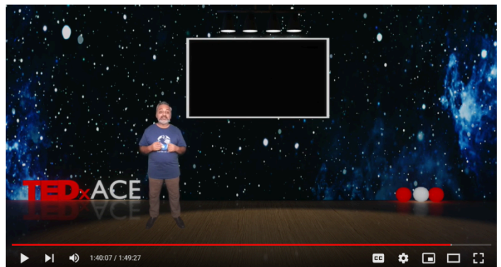
Speaker-5: Subhajit Mukherjee