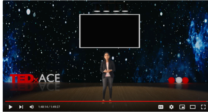
Vote of Thanks - Prachi Chodankar